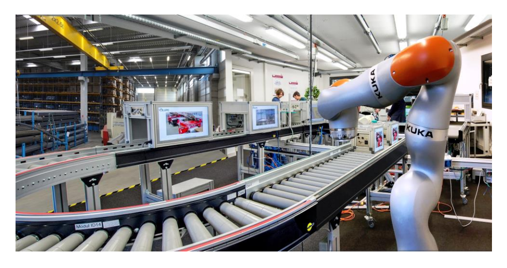
Fig. 1. Hybrid teaching and learning environment in RACI4.0.

Learning factories are learning environments in which participants are trained by the usage of simulated real production processes, which are as realistic and authentic as possible [6]. They offer a basis for self-controlled and informal learning [7] and pursue an action-oriented approach for the competency development by means of structured self-learning processes that are supported by different teaching methods [8]. These teaching methods move the teaching and learning processes close to real industrial situations [1]. Digitized learning factories cover topics of digitization, make use of new digital possibilities within their didactic approach, and "make use of digital tools for the purpose of learning production related concepts and subjects" [9]. That is for example: relevant aspects of production are hardware- and/or software-based replicated and can be tested, investigated, and simulated for the purpose of conveying skills and competencies.